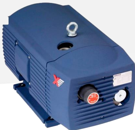
VX 4.16 VX 4.25 VX 4.40